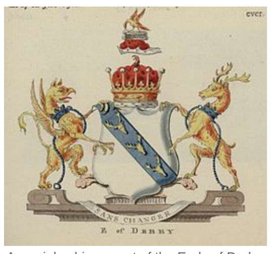
Armorial achievement of the Earls of Derby